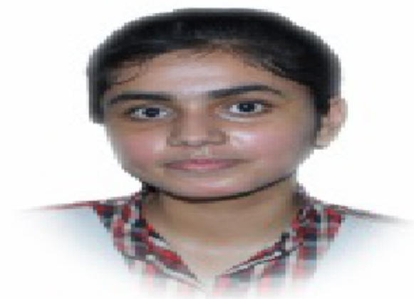
ANUSHKA SHARMA- 95.6%